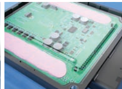
Gap Filler 1000SR dispenses into position without slumping. With minimal pressure, flows in place with little or no stress on components.