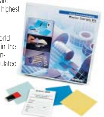
FREE Master Sample Kit

Qualify for your Master Sample Kit on-line: www.master.bergquistco.com or call us at 1-888-942-8552