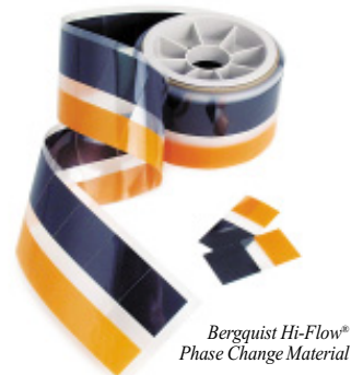
Bergquist Hi-Flow® Phase Change Material