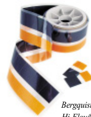
Bergquist Hi-Flow® Phase Change Material

Test it for yourself. Your FREE sample kit is only a call away.