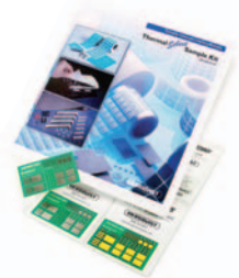
FREE Select Sample Kit.

To qualify for a FREE Thermal Clad Select Sample Kit, please visit our web site or call today.