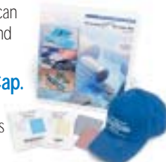
FREE sample kit and S-Cap

Visit our web site or call today to qualify for your FREE S-Class sample kit and S-Cap.