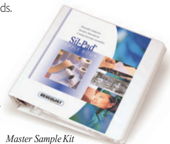
Master Sample Kit

This master sample kit contains 42 different thermal interface materials. Includes new, comprehensive 76-page Selection Guide.