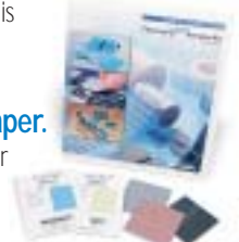
FREE white paper and sample kit

Visit our web site or call to qualify for your FREE Gap Pad sample kit and white papers detailing the new line of Gap Pad S-Class products.