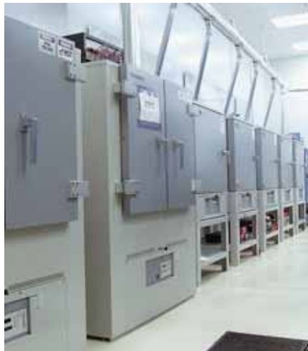
Chamber Ovens – Over 3000 cubic feet (85 cubic meters) of oven capacity is dedicated to long term thermal bias age testing. The ovens take material to temperatures above T_g . At selected intervals, samples are removed and tested to verify material integrity.