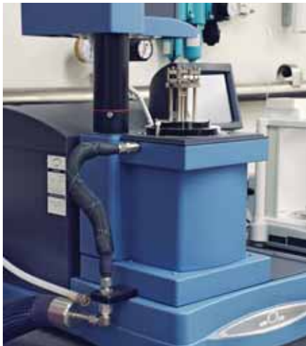
Dynamic Mechanical Analysis (DMA) – Measures the modulus of materials over a range of temperatures.