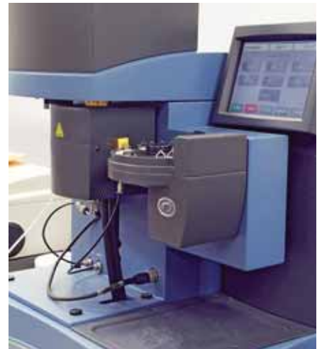
Thermogravimetric Analyzer (TGA) – Measures the stability of our dielectrics at high temperatures, baking the materials at prescribed temperatures and measuring weight loss.